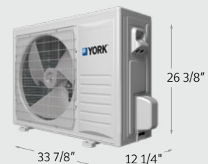
HMCG2 Horizontal Discharge A/C